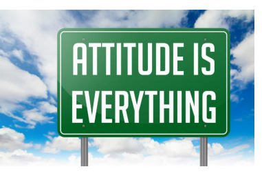
Impact of your Attitude on Employees Monday, September 10, 2018 8:30 am to 4:30 pm More information