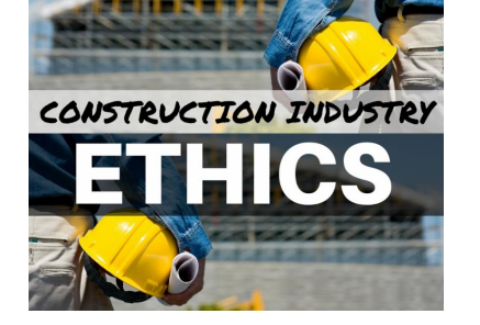
Construction Ethics Course Tuesday, September 11, 2018 8:30 am to 4:30 pm More information